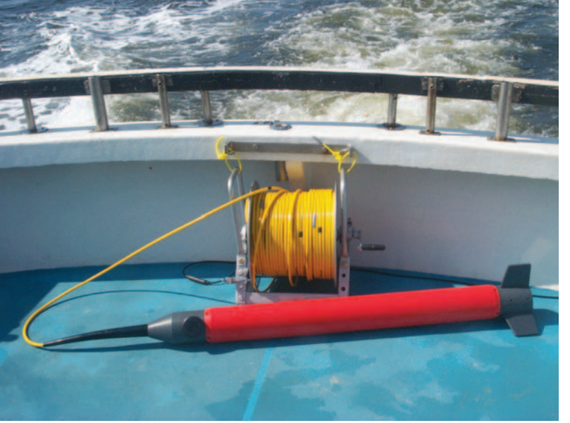
SeaSPY towfish with altimeter and 200m of cable on a metal reel