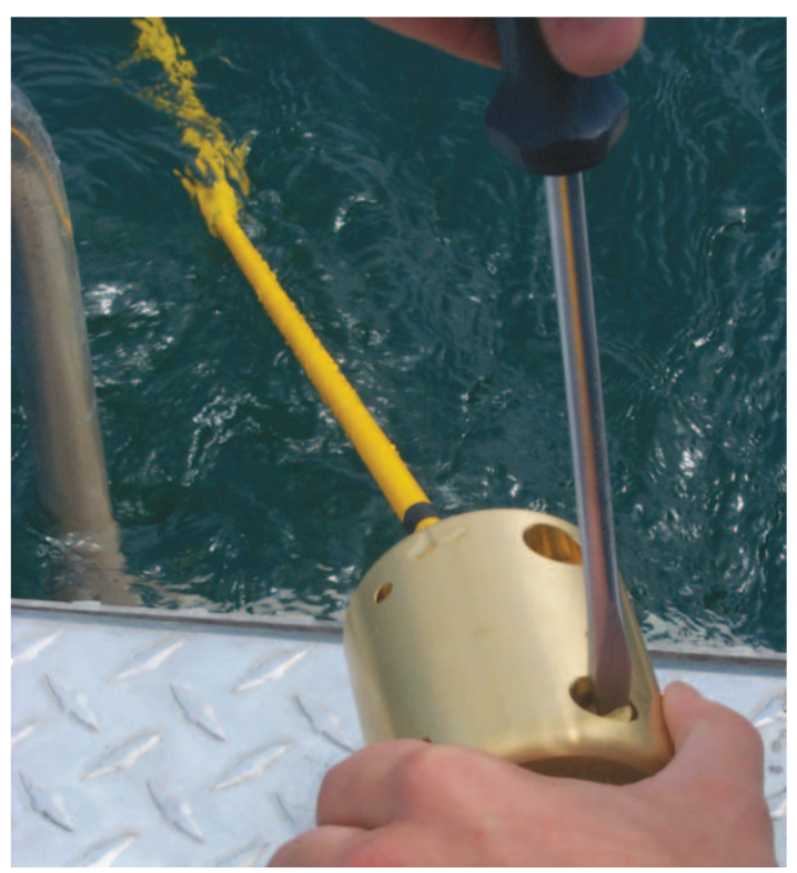
Brass tow cable weight attached to MMC's cable

Each weight weighs about 6lbs in water and can be installed or removed with a screwdriver, enabling the user to remove or add weights at will.